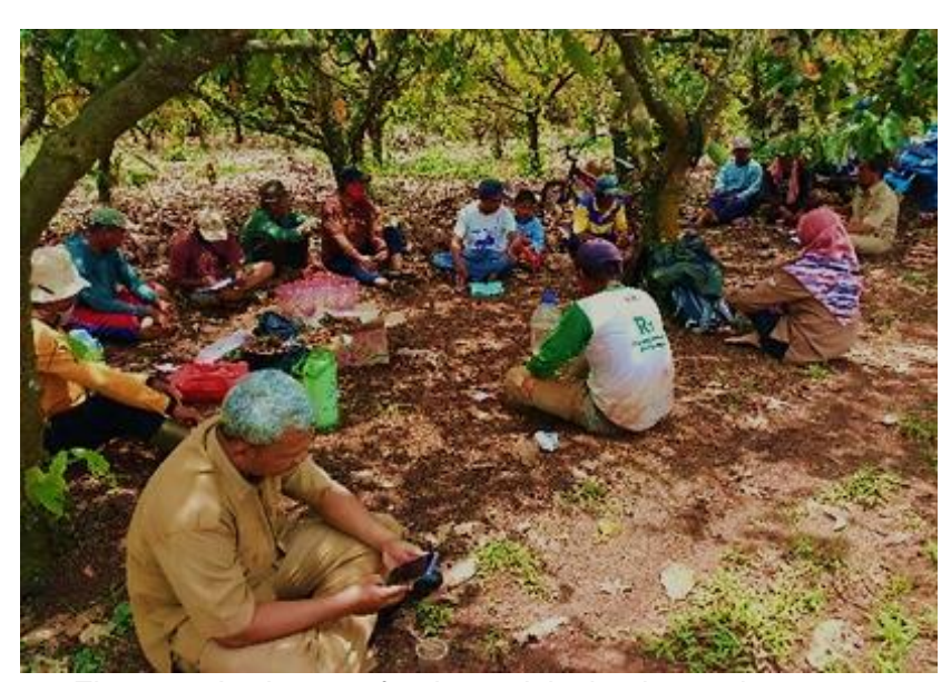
Figure 4. Assistance for the activity implementing group.