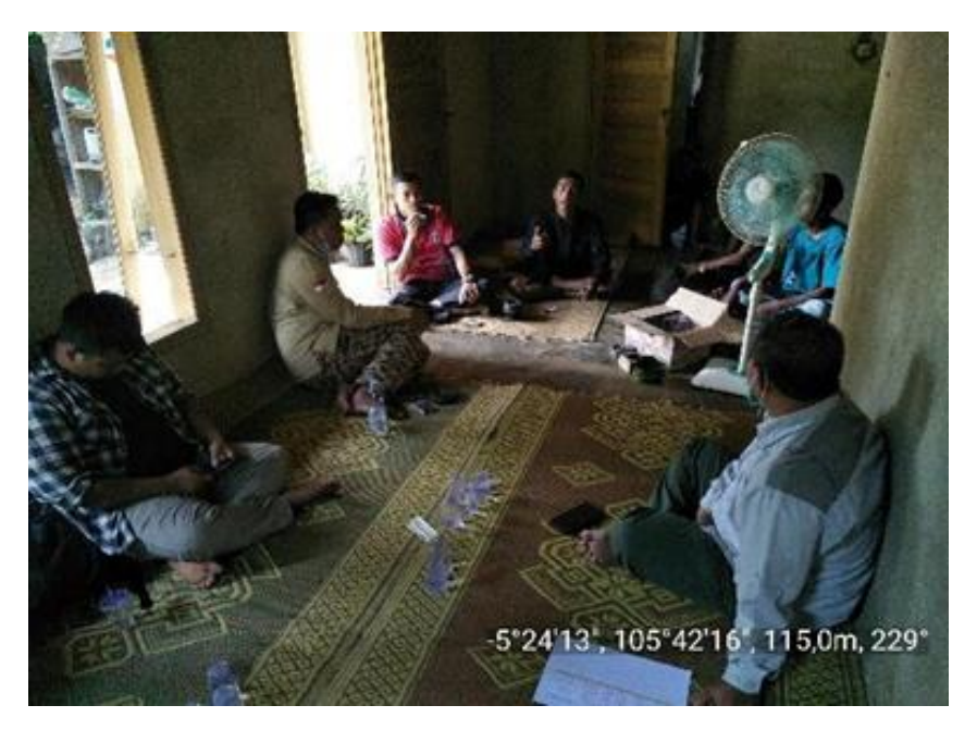
Figure 2. Social, cultural and community conflict preconditions.

The response was responsive, so the BPDAS WSS sent a team to measure the area to be carried out by RHL in Girimulyo Village in October 2020. The team consisted of the BPDAS WSS team and was assisted by students from the University of Lampung Forestry Department who were conducting general practice at BPDAS WSS.